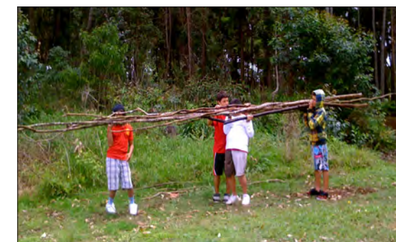
Harvesting waiawi to build fence.