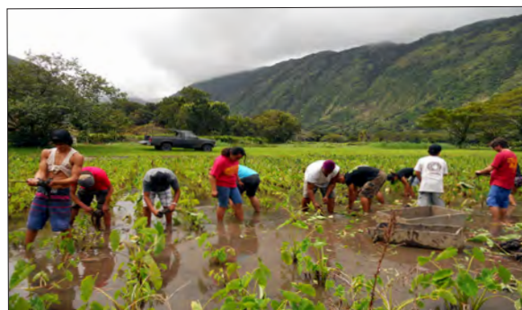
Nā haumāna practice laulima to huki kalo.

We look forward to our next huaka'i to their kitchen to see the process come full circle and see how their kalo becomes poi.