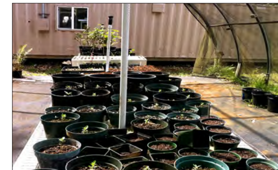
Happy pilo in the shade house with timed irrigation.