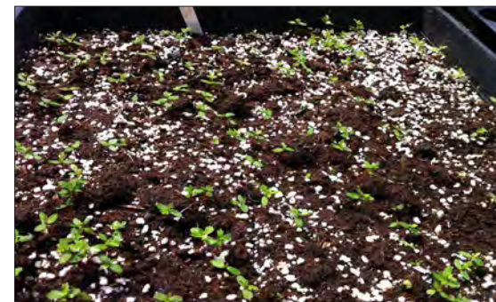
Plenty of 'ulei on the way!

The haumāna have also been busy in the forest and shade house propagating koa, pilo, and two varieties of 'ulei. The outer edge of the forest has been covered with shade cloth to kill grass and open up space for out-planting of native species. This will allow us to grow a perimeter of native forest from the ground up without having to worry about the eucalyptus. We will be visiting Pu'u Mali in late April to learn about and help with the restoration of Palila habitat. We are also planning a huaka'i to Pu'u Pili in May to learn about its native forest habitat and help the Kohala Watershed Partnership with their conservation effort. We are always looking for native seeds to plant so let us know if you can help us find some!