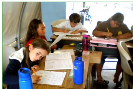
Nā Kamalii keiki are working hard on their second drafts in Writer's Workshop.