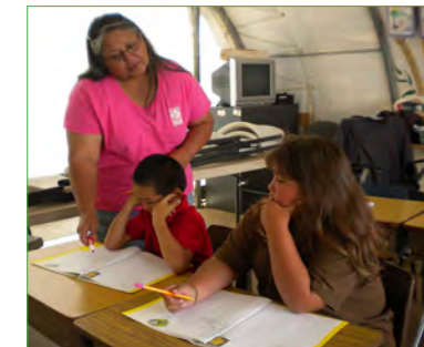
Aunty Deedee working with nā haumana.